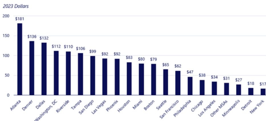
Figure 2. Average Monthly Cost of Price Coordination for Units using RealPage Software in 2023

for units using RealPage software by metro are shown in Figure 2. The total cost to renters in 2023 was approximately $3.8 billion.