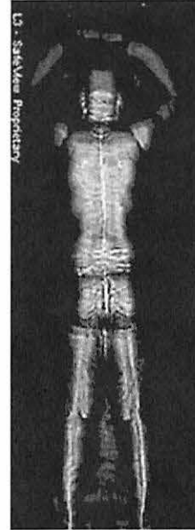
Millimeter wave image

While the equipment has the capability of collecting and storing an image, the image storage functions will be disabled by the manufacturer before the devices are placed in an airport and will not have the capability to be activated by operators. Images will be maintained on the screen only for as long as it takes to resolve any anomalies; if a TSO sees a suspicious area or prohibited item, the image will remain on the screen until the item is cleared either by the TSO recognizing the item on the screen, or by a physical screening by the TSO with the individual. The image is deleted in order to permit the next individual to be screened. The equipment does not retain the image. In addition, TSOs will be prohibited from bringing any device into the viewing area that has any photographic capability, including cell phone cameras. Rules governing the operating procedures of TSOs using this WBI equipment are documented in standard operating procedures (SOP), and compliance with these procedures is reviewed on a routine basis. Due to the sensitivity of the technical and operational details, the SOP will not be publicized, however, TSOs receive extensive training prior to operating WBI technology.