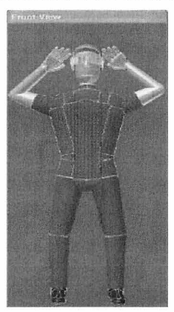
Generic Figure Highlighting Area for Resolution

suspected, or will highlight the anomaly location on a generic figure that is displayed on a monitor that the checkpoint TSO can read. A sample generic figure with a sample highlighting appears below. The TSO at the checkpoint will then conduct a physical pat-down that is focused on the particular area and not necessarily of the individual's entire body which would normally occur absent the added information from the WBI technology.