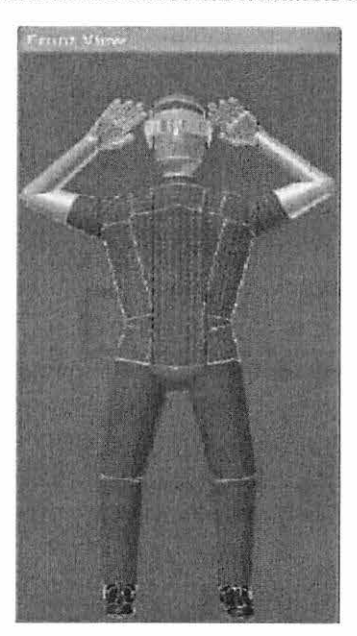
Generic Figure Highlighting Area for Resolution

The TSO who views the image will be located remotely from the individual being screened so the TSO will not be able to see the actual individual. The TSO viewing the image will communicate with the TSO at the checkpoint through a red/green light system, or through a monitor located at the checkpoint on which there will be an indication either that there is no anomaly to be resolved such that the individual can proceed or that an anomaly exists that must be resolved. If there is an anomaly to be resolved, the TSO will communicate via radio to direct the TSO at the checkpoint to the location on the individual's body where a threat item is suspected, or will highlight the anomaly location on a generic figure that is displayed on a monitor that the checkpoint TSO can read. A sample generic figure with a sample highlighting appears below. The TSO at the checkpoint will then conduct a physical pat-down that is focused on the particular area and not necessarily of the individual's entire body which would normally occur absent the added information from the WBI technology.